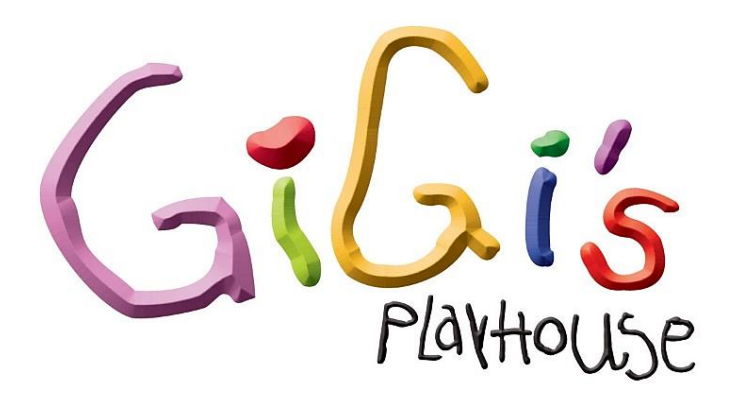
Down Syndrome Achievement Centers